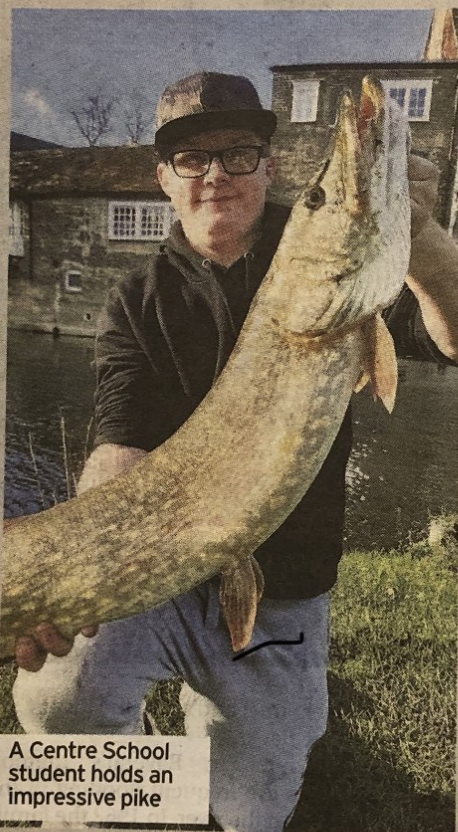
A Centre School student holds an impressive pike

STUDENTS at The Centre School in Cottenham are getting hooked on fishing – thanks to a grant from the Angling Trust, which has donated just under £3,000 to ensure that fishing, a popular activity at the school, can be further developed.